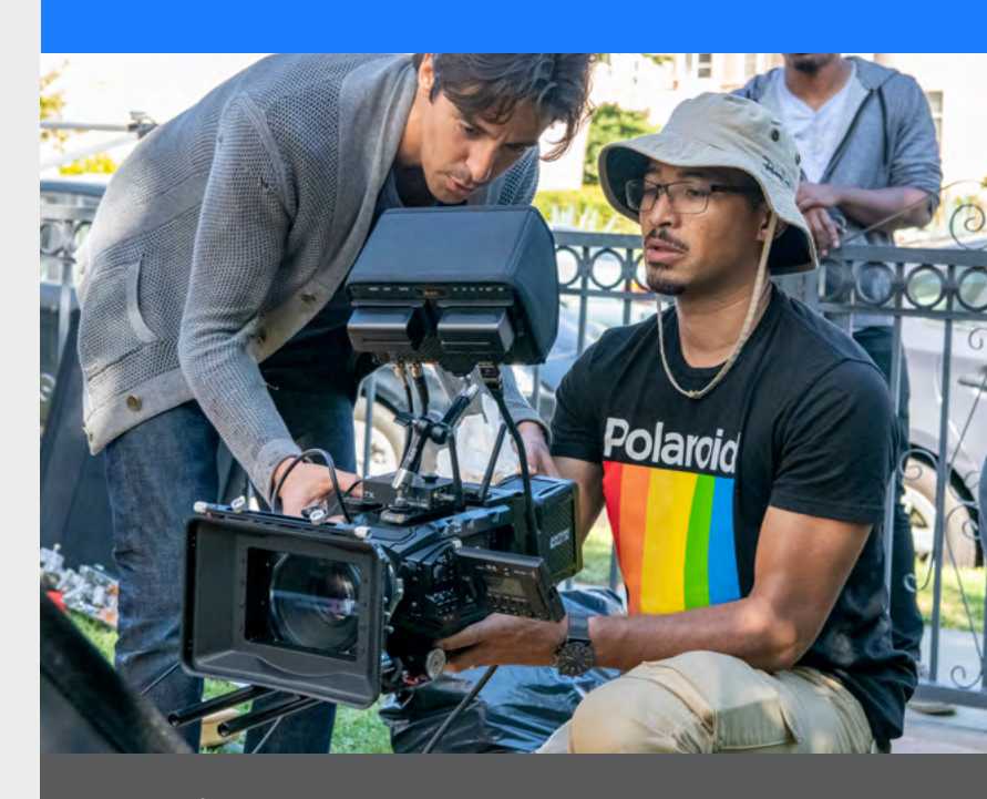
Directing and filming a conservation commercial.

Our commitment to competitive pay and a safe, inclusive work environment, ensures that your hard work and dedication are recognized and rewarded appropriately, providing an additional incentive to excel in your professional endeavors.