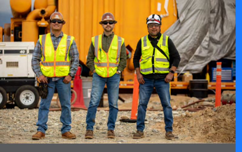
Starting the day at the Etiwanda Pipeline Re-liner during Phase 3.