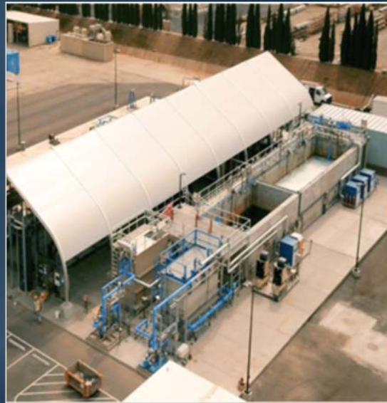
Item 7-3 Slide 3