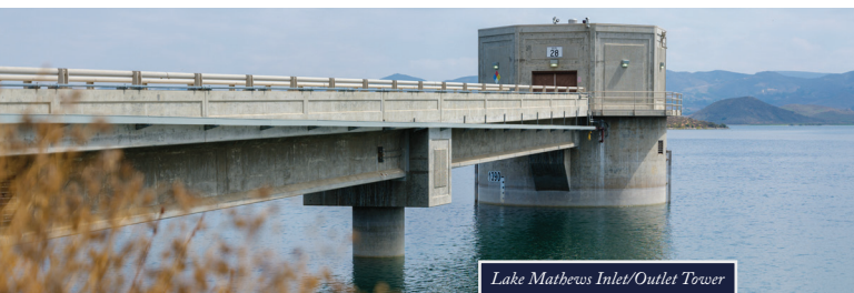
Lake Mathews Inlet/Outlet Tower

Uses of Funds: State Water Project payments, 26%; operations & maintenance, 26%; debt service, 13%; construction, 15%; fund deposits, 11%; demand management programs, 2%; supply programs, 3%; and Colorado River power, 3%; other 0% (Biennial Budget FY 2024/25, FY 2025/26)