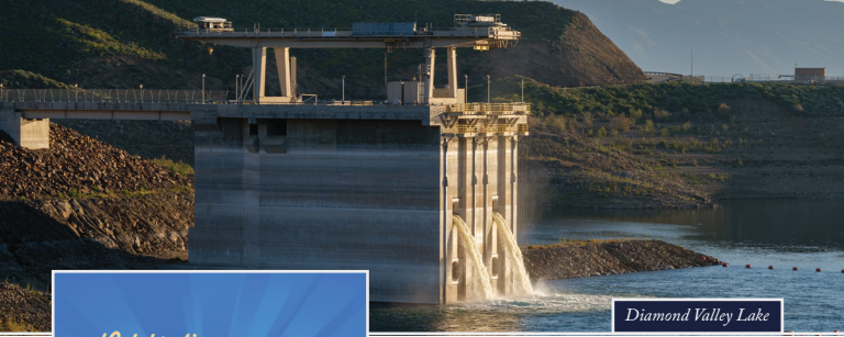
Diamond Valley Lake