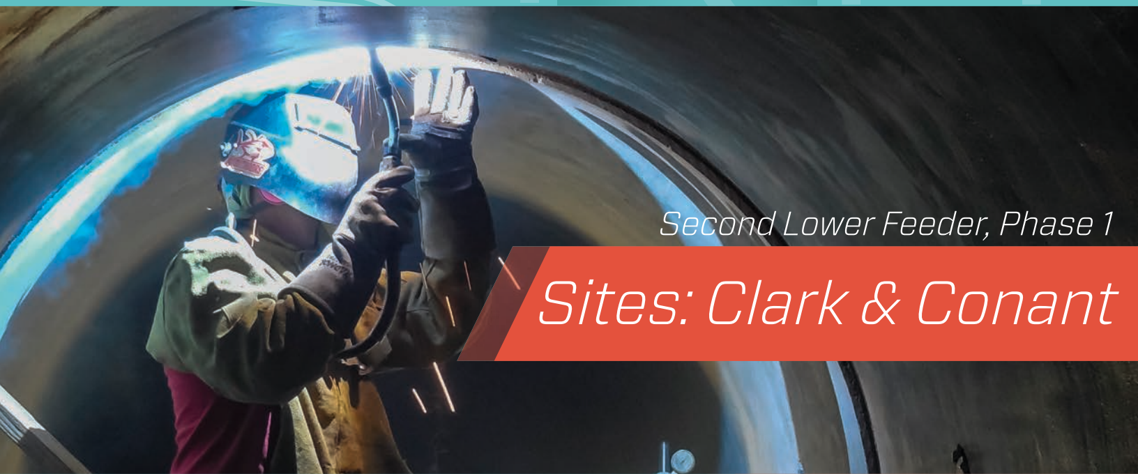
Second Lower Feeder, Phase 1