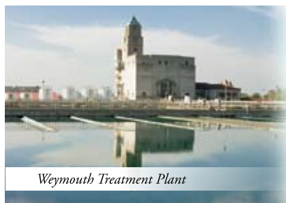
Weymouth Treatment Plant

service, 16%; fund deposits, 11%; supply programs, 6%; demand management programs, 3%; and Colorado River power, 2%.