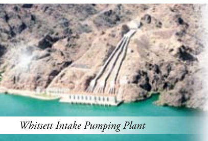
Whitsett Intake Pumping Plant