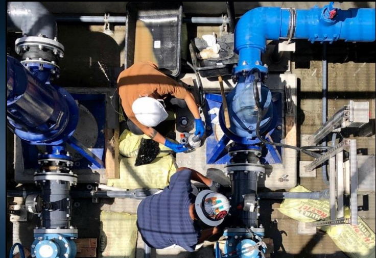
Pump and Piping Improvements