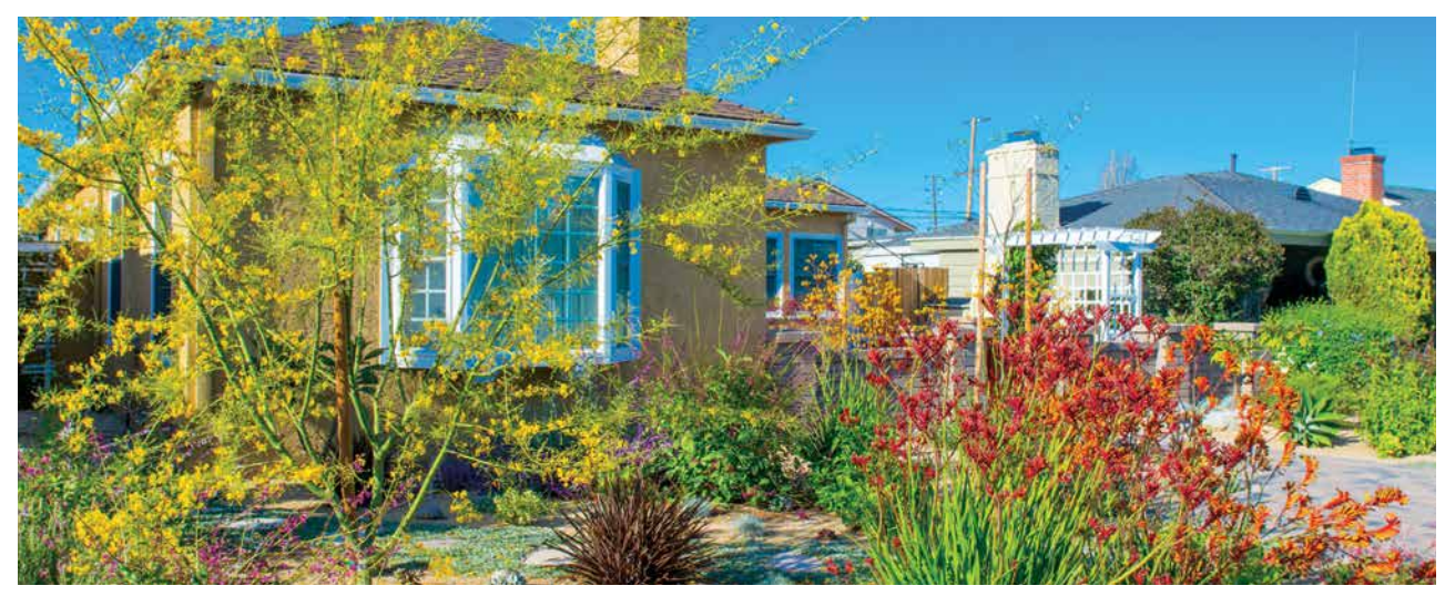
Colorburst From a California Friendly™ Waterwise Garden

Metropolitan was founded as a builder – the agency formed to engineer and build the Colorado River Aqueduct and bring water to Southern California. We build things, but we also build on a legacy of foresight, engineering acumen, and responsible planning.