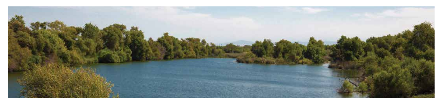
Bay Delta Waterway

Metropolitan has a $60 million annual share of investments in environmental activities in the Sacramento - San Joaquin Delta, the northern hub of the state's water system. To reach a balance between environmental and urban water needs, Metropolitan supports many programs that include ecosystem restoration, fish hatchery and mitigation projects, the Interagency Ecological Studies Program, water quality studies and environmental protection projects.