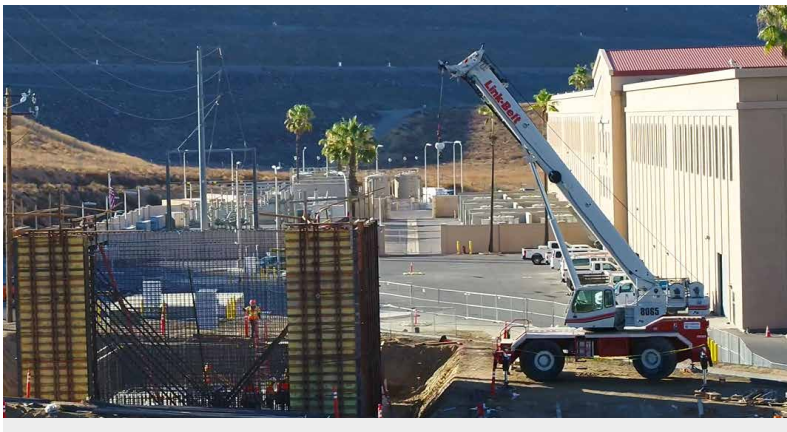
Wadsworth Pumping Facility at Diamond Valley Lake

As climate change puts increasing pressure on supplies imported from Northern California and the Colorado River, we need to develop a more flexible and resilient water supply portfolio for Southern California. Our quality of life, environment and economy depend on it. The CAMP4W will evaluate imported water supplies, water efficiency and local water projects through the lens of climate adaptation, sustainability and equity.