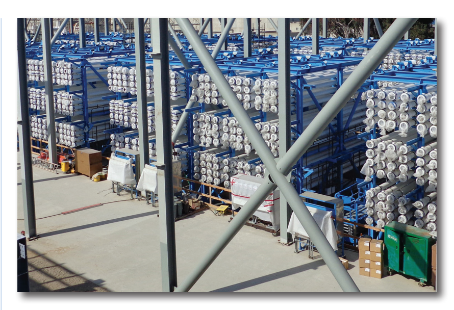
Reverse osmosis vessels are a key part of the desalination process.

The heart of the desalination plant is a reverse-osmosis system designed by IDE Technologies. Ocean water is pumped to the desalination plant, where it undergoes a sand/anthracite filtration process to remove suspended particles from the water. Then, the water is pumped through reverse-osmosis membranes that remove salts and other dissolved particles. Essential minerals are added back into the water before it is piped to the Water Authority's aqueduct as drinking water.