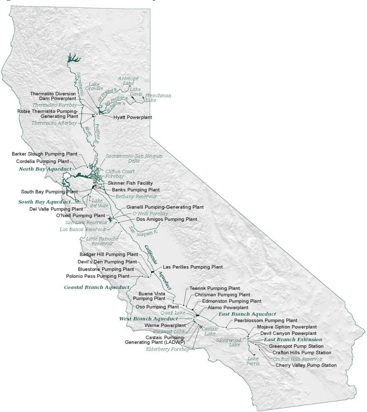
Figure 1. Facilities of the State Water Project