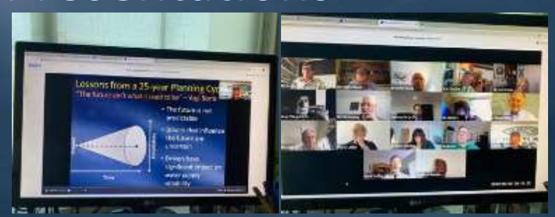
MWDOC Workshop – 60 participants May 6