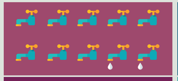
Do Nothing Strategy: By 2040, restrictions eight out of ten years.