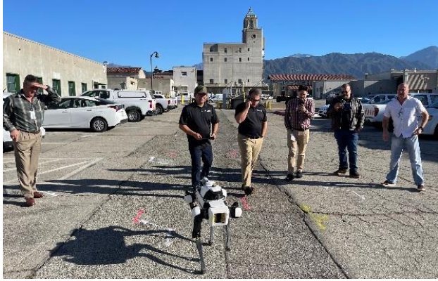
The Security and Emergency Management Unit staff testing cutting edge security technology at the Weymouth Treatment Plant.